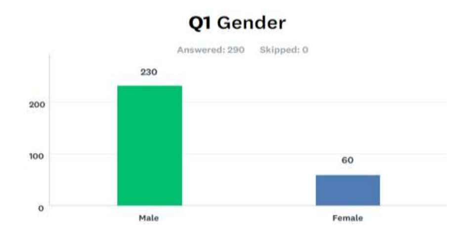
Figure 1 – Gender of Primary Research Respondents

The online survey was filled in by 290 respondents from the Kurdistan region. The respondents had a significant skew of male respondents, which made up almost 80% of the total respondents (figure 1 for breakdown). 97% of the total respondents were citizens of the Kurdistan region with the remaining respondents being refugees, internally displaced people and foreigners (figure 2). In terms of the type of residence, 75% of the respondents had city dwellings with the remaining across district, sub-district, village, compound and other locations (figure 3). For the location of the residences, 75% were from Erbil and the remaining respondents were from Sulaymanyah, Duhok, Halabja and other locations (figure 4). For the economic status of the respondents, 30% were unemployed with the 70% being employed with variations in monthly income levels (figure 5). For the educational level achieved by the respondents, 70% had university and college degrees, 20% had masters' degrees and PhDs, and the remaining had up to preparatory and secondary schooling (figure 6). For the ages of the respondents, these were spread out with 38% from 26 to 35 years old, 33% from 14 to 25 years old, 22% from 35 to 44 years old, and the remaining respondents were in the 45 to 55 years old and older than 55 years old age groups (figure 7).