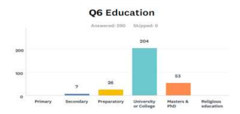
Figure 6 – Education Level of Primary Research Respondents